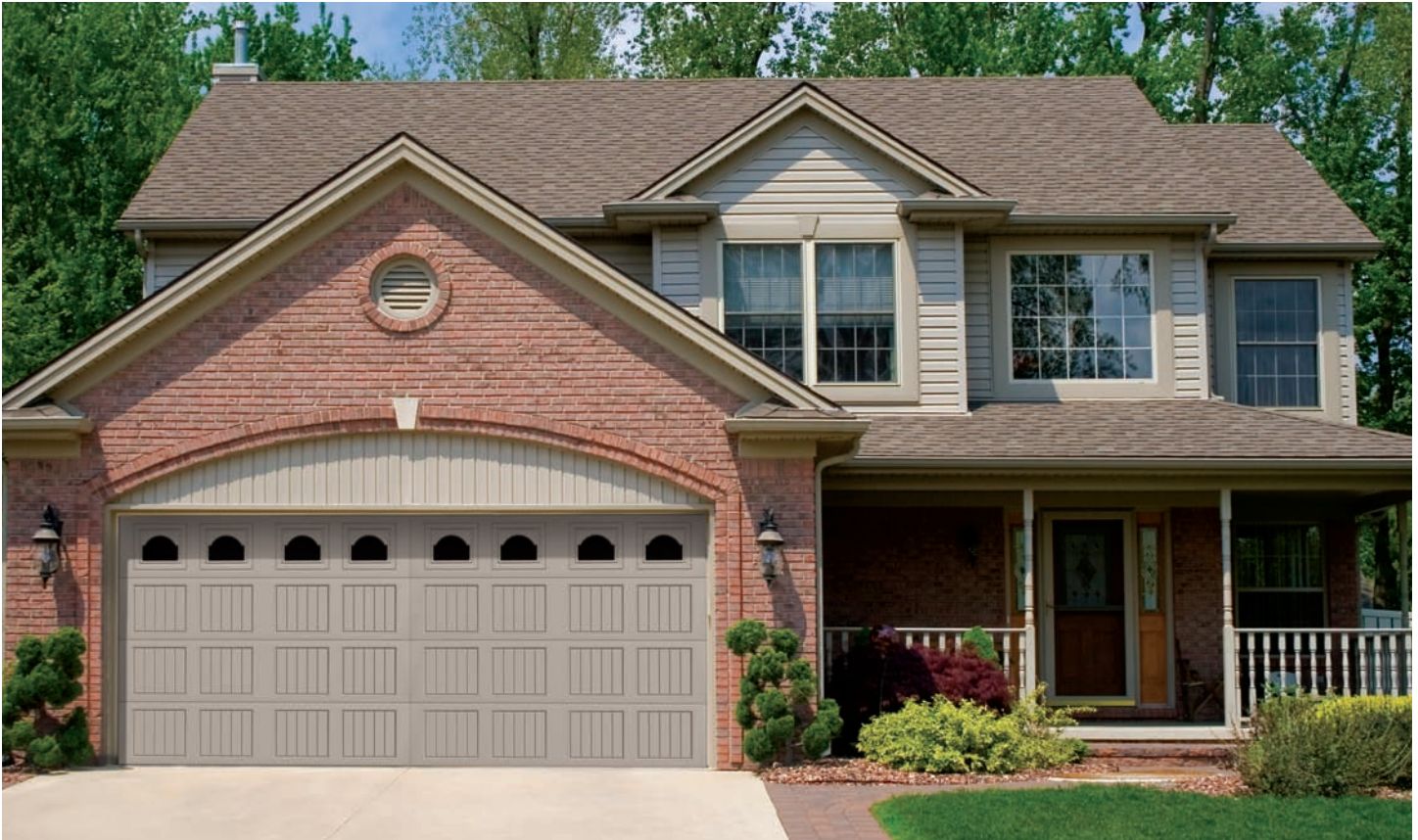
Model 9100 shown in Sonoma design with Cathedral I window inserts